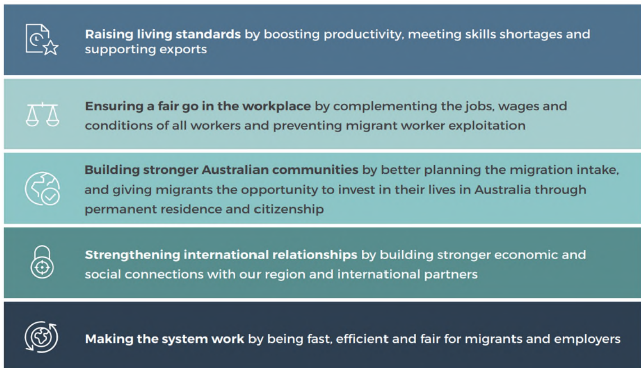
Figure 1: The five core objectives that underpin Australia's migration system

Permanent migration is also at the centre of building a stronger Australian community, which recognises the important contributions that permanent migrants make in Australia. Restoring permanent residence to the heart of our migration system will help build a more vibrant, modern and multicultural Australia.